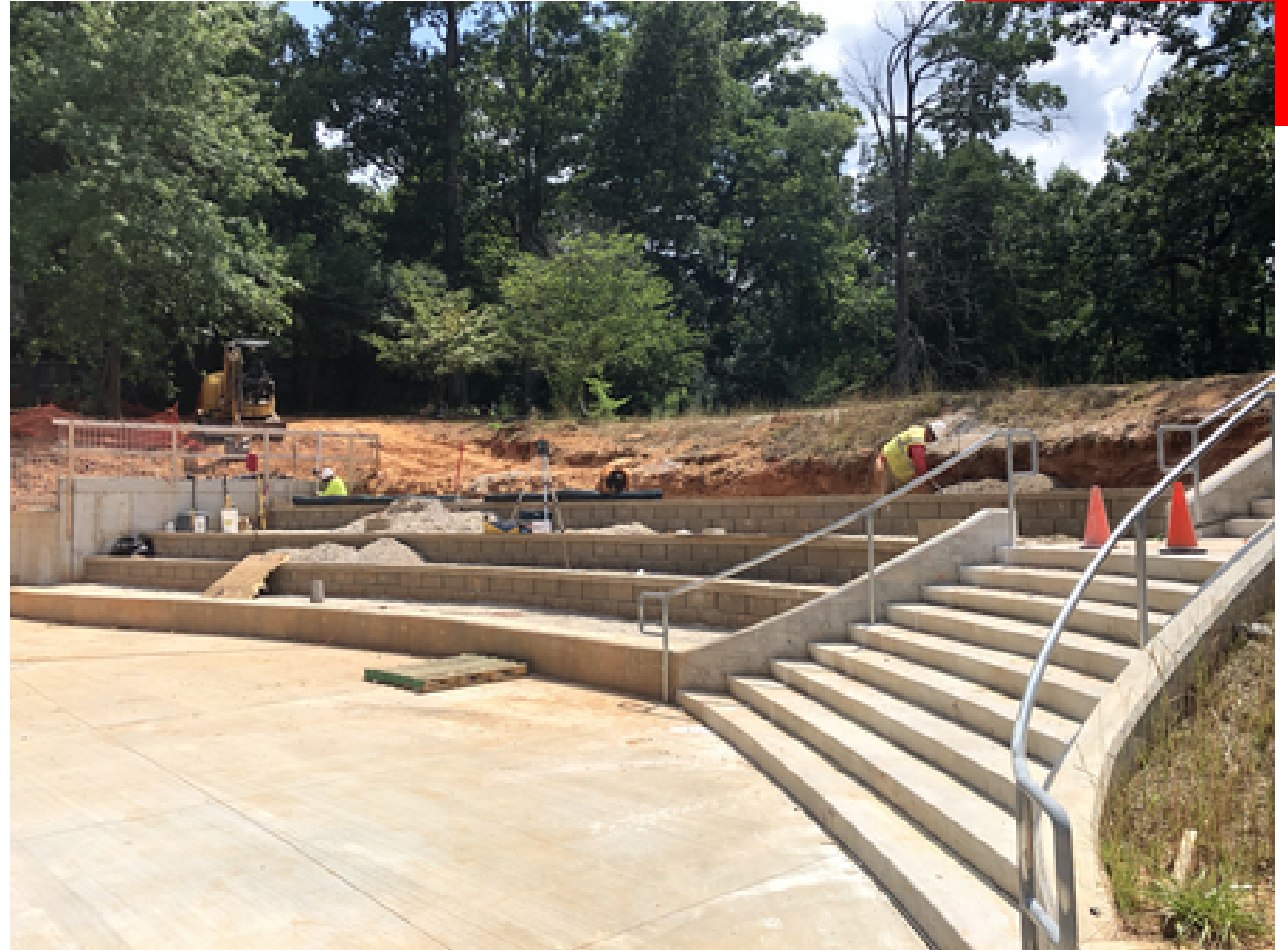
Seat wall installation