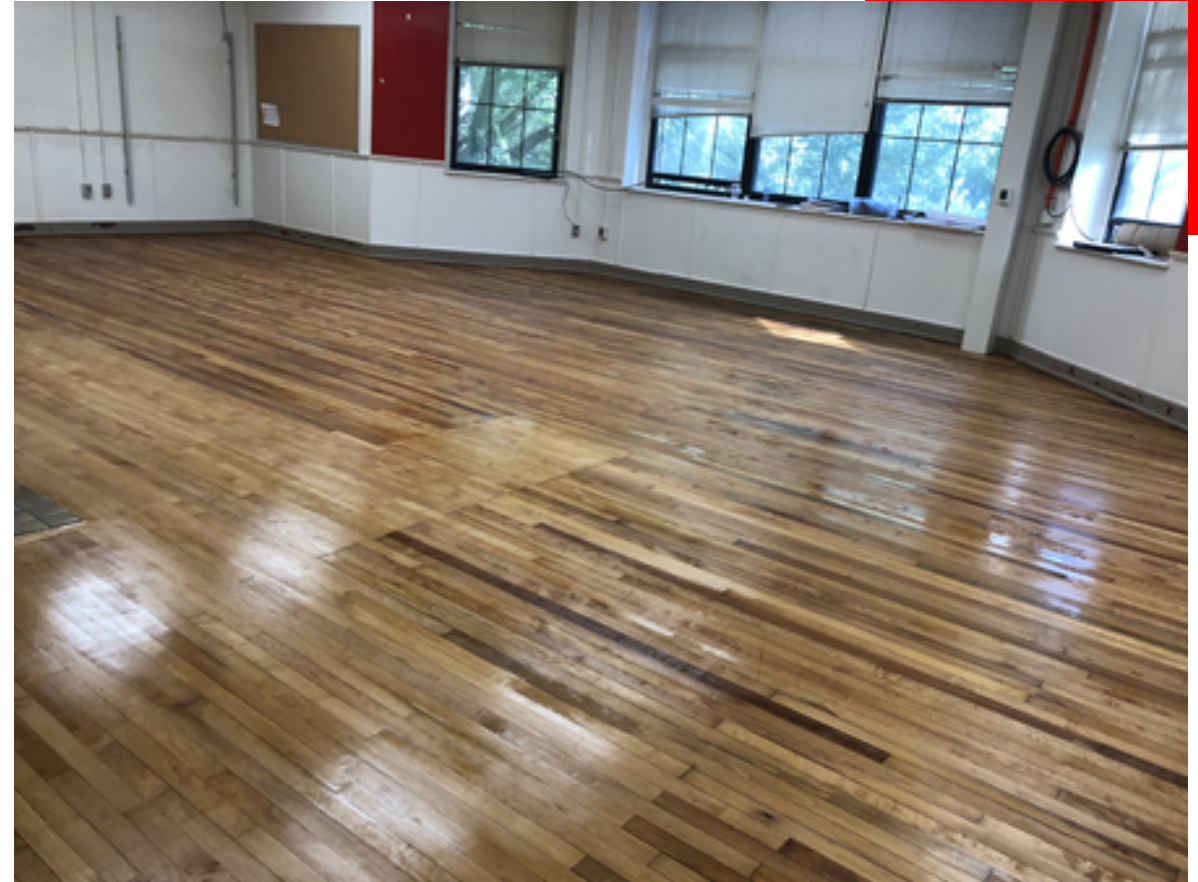
Wood flooring refinishing