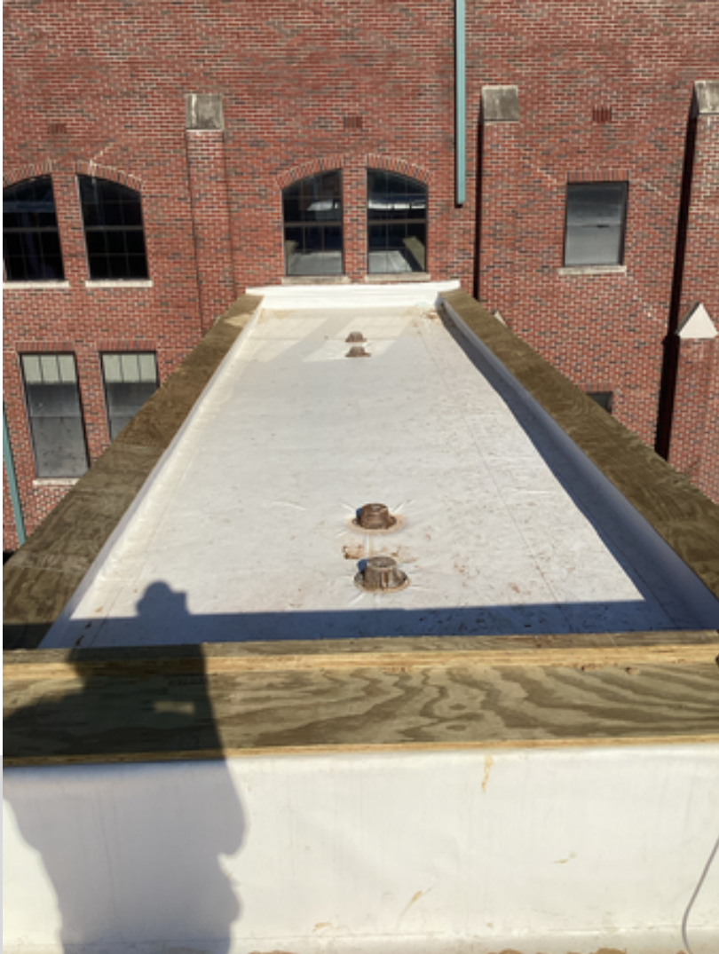
Roof drain/Parapet installation