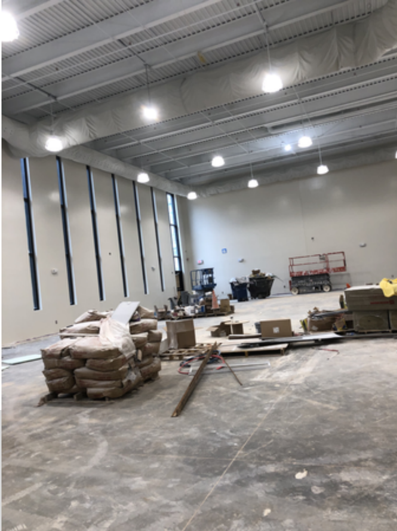
Lighting installation at gym