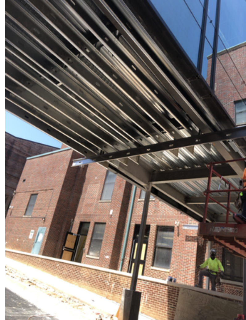
Bridge framing for EIFS