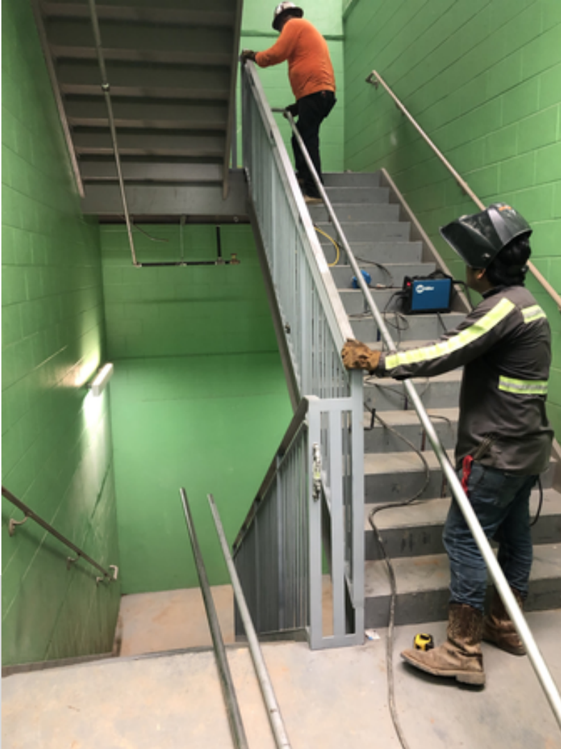
Grab bar installation